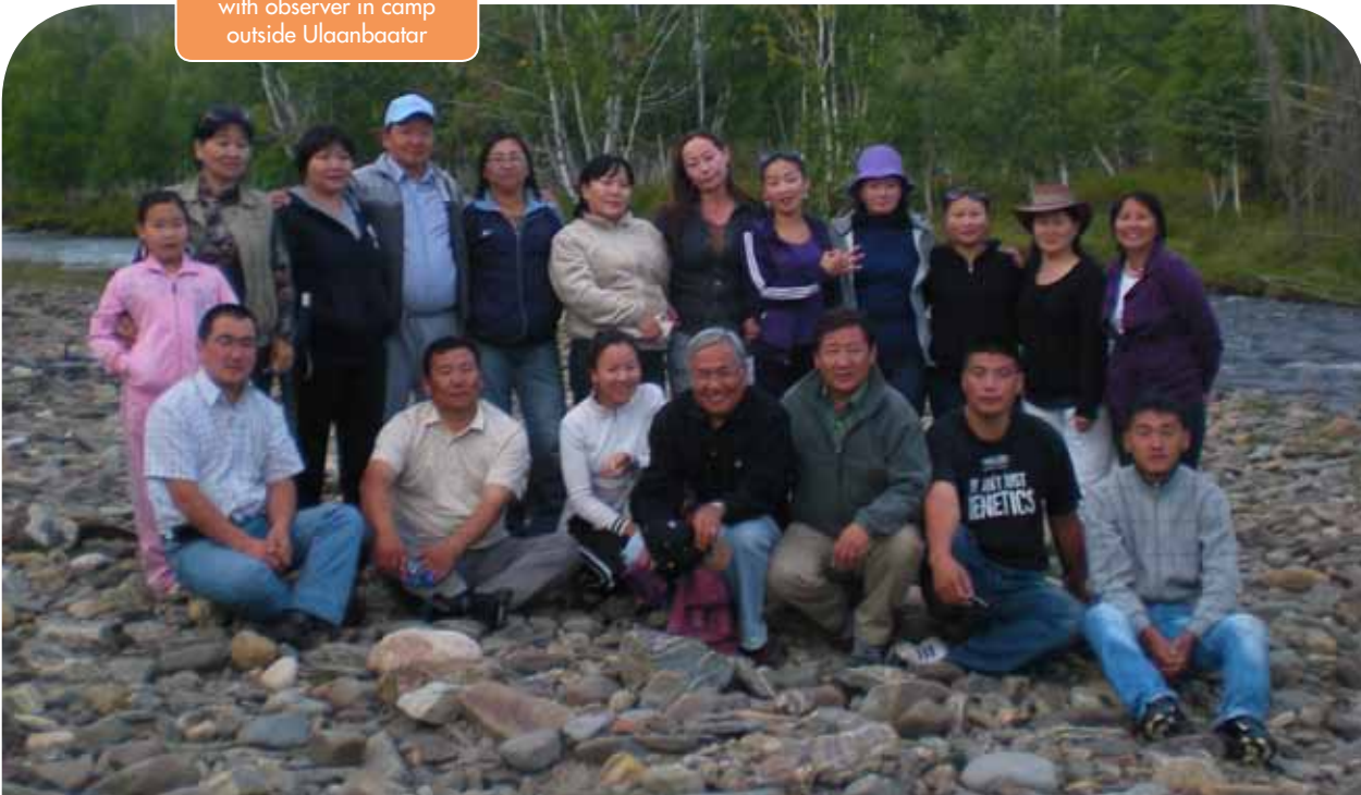
USUG Management Team with observer in camp outside Ulaanbaatar

The reforms sought by Decree 182, announced a few months after the WOP began, gave USUG and VEI a chance to contribute to the sector reform process. More importantly, the partners were able to realign USUG's proposed reorganization according to the new sector reform principles. USUG's request for assistance in donor coordination was also timely since it offered an opportunity for VEI to advise USUG on coordination of programmes and projects proposed in the water supply and sewerage master plans ■