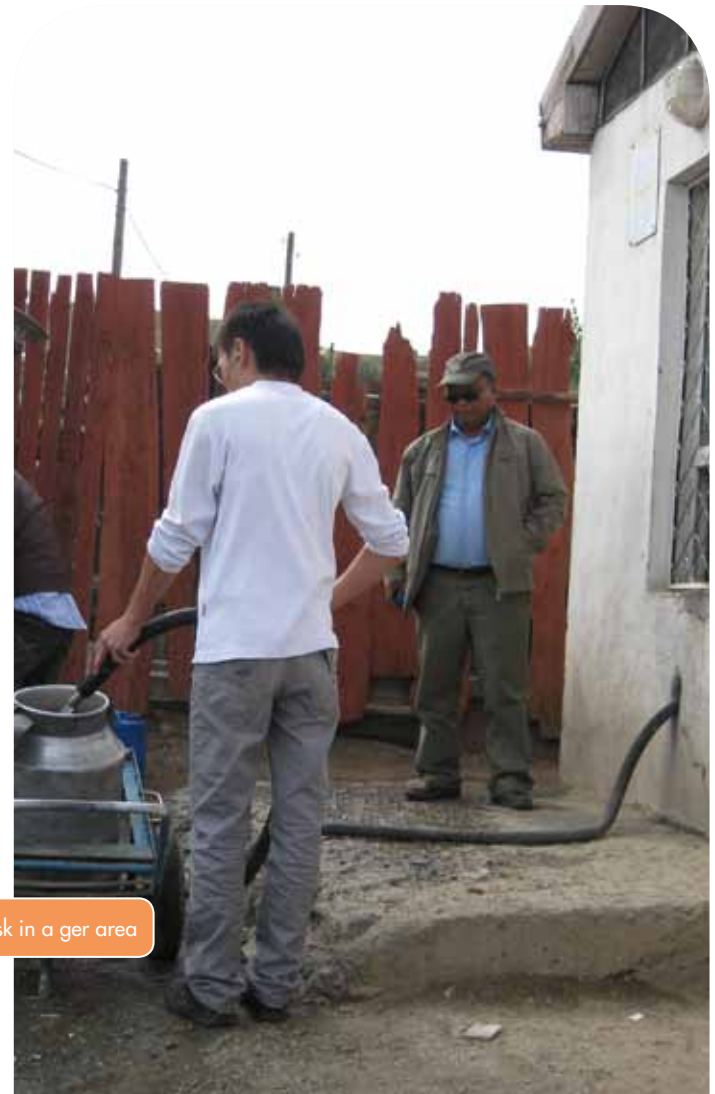
A water kiosk in a ger area

Supply and Sewerage Authority of Ulaanbaatar City as implementing partner and financier; Vitens-Evides International as implementing partner and financier; and the Dutch embassy in Beijing representing the Netherlands Ministry of Foreign Affairs and its Directorate-General for International Cooperation as observer to the Steering Committee and financier.