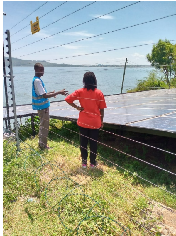
Solar panels fitted to augment energy supply on one of the water supply schemes.