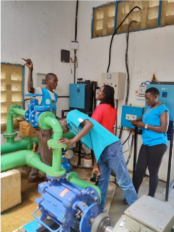
Rehabilitation of one of the water supply treatment systems