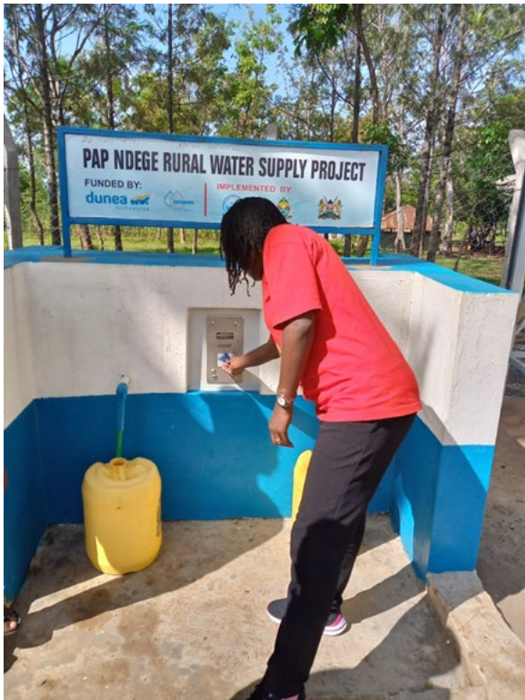
A mini grid fitted with automated payment system