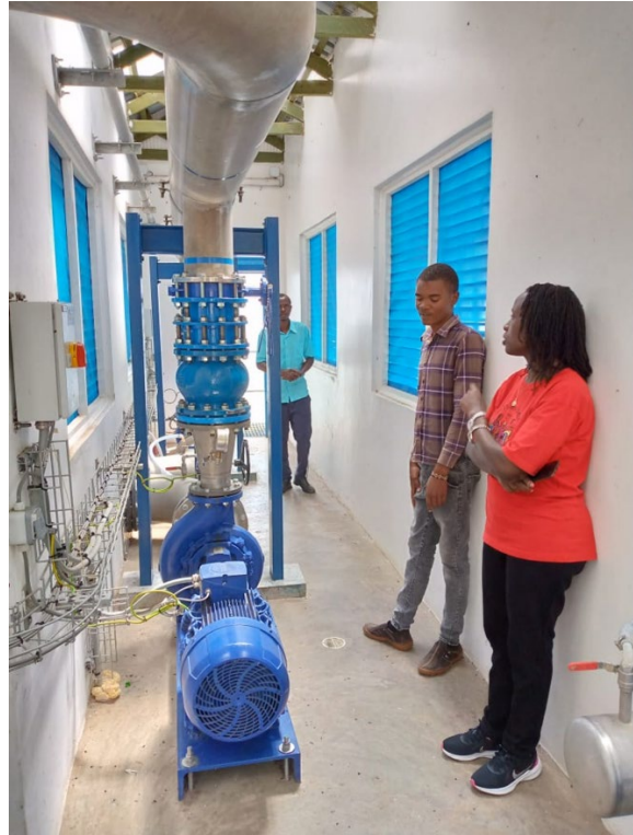
New pumps installed for one of the water supply systems