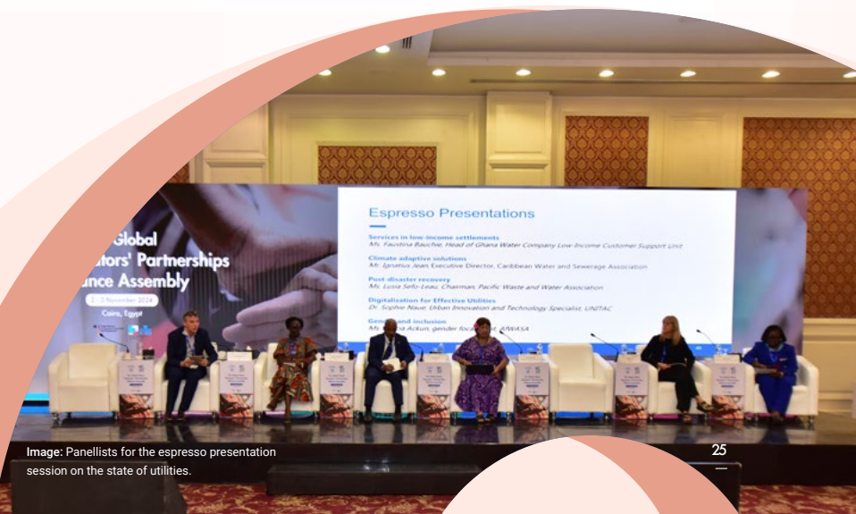
Image: Panellists for the espresso presentation session on the state of utilities.

Ms. Ackun addressed the gender disparities within African water utilities, where women make up only 17 per cent of board members, 21 per cent of engineers and 14 per cent of technicians. To tackle this, AfWASA's initiatives include implementing a gender strategy, forming gender committees with focal points in utilities (10 established to date), and building women's networks for mentorship and leadership development. She called for GWOPA's collaboration to expand these initiatives.