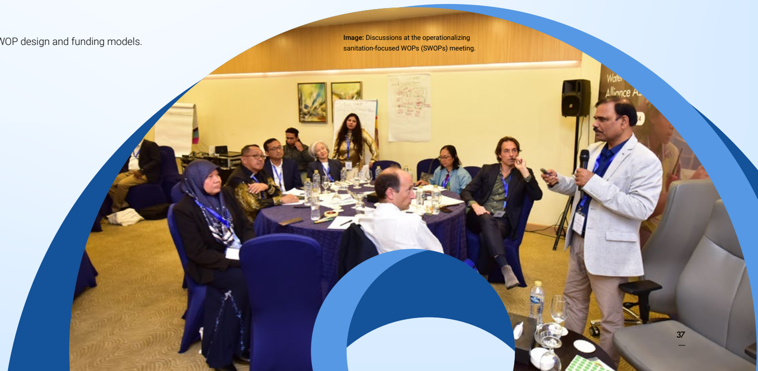
Image: Discussions at the operationalizing sanitation-focused WOPs (SWOPs) meeting.