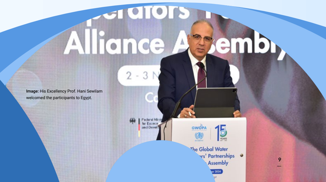
Image: His Excellency Prof. Hani Sewilam welcomed the participants to Egypt.

He spotlighted Action on Water Adaptation and Resilience (AWARe), launched at the Climate COP27 and hosted in Egypt with 30 Member States, that has trained 250 water professionals from Africa and secured funding to train 3,000 more in the next three years in collaboration with different organizations. He urged the water and sanitation sector to work with young professionals and nurture them for sustainable development.