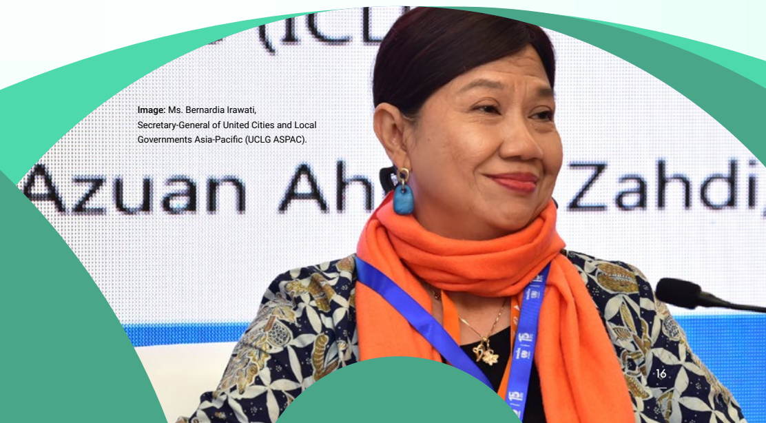
Image: Ms. Bernardia Irawati, Secretary-General of United Cities and Local Governments Asia-Pacific (UCLG ASPAC).

She also highlighted UCLG ASPAC's collaboration with UN-Habitat on local voluntary SDG reviews (LVRs), of which 20 reviews have been completed in the region, and municipal sanitation programmes, stressing the importance of innovative financing, while supporting local governments to develop by-laws to conduct participative stakeholder consultations, and engaging in peer learning, which included for example 280 municipal leaders notably on Citywide Inclusive Sanitation (CWIS). Advocacy from local to national levels remains key in mobilizing resources and engaging with local leaders.