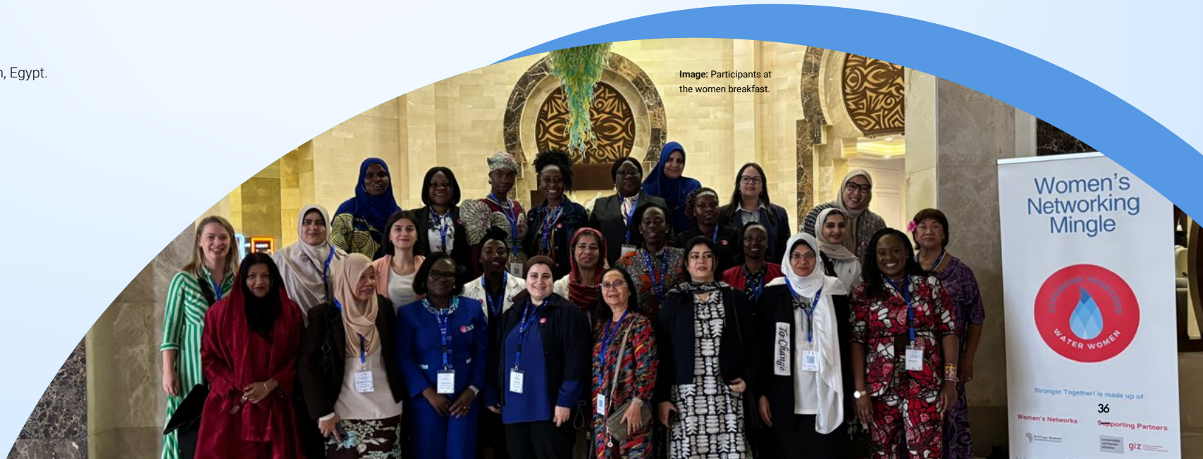
Image: Participants at the women breakfast.

Promoting policies and practices that address gender disparities in the water and sanitation workforce.