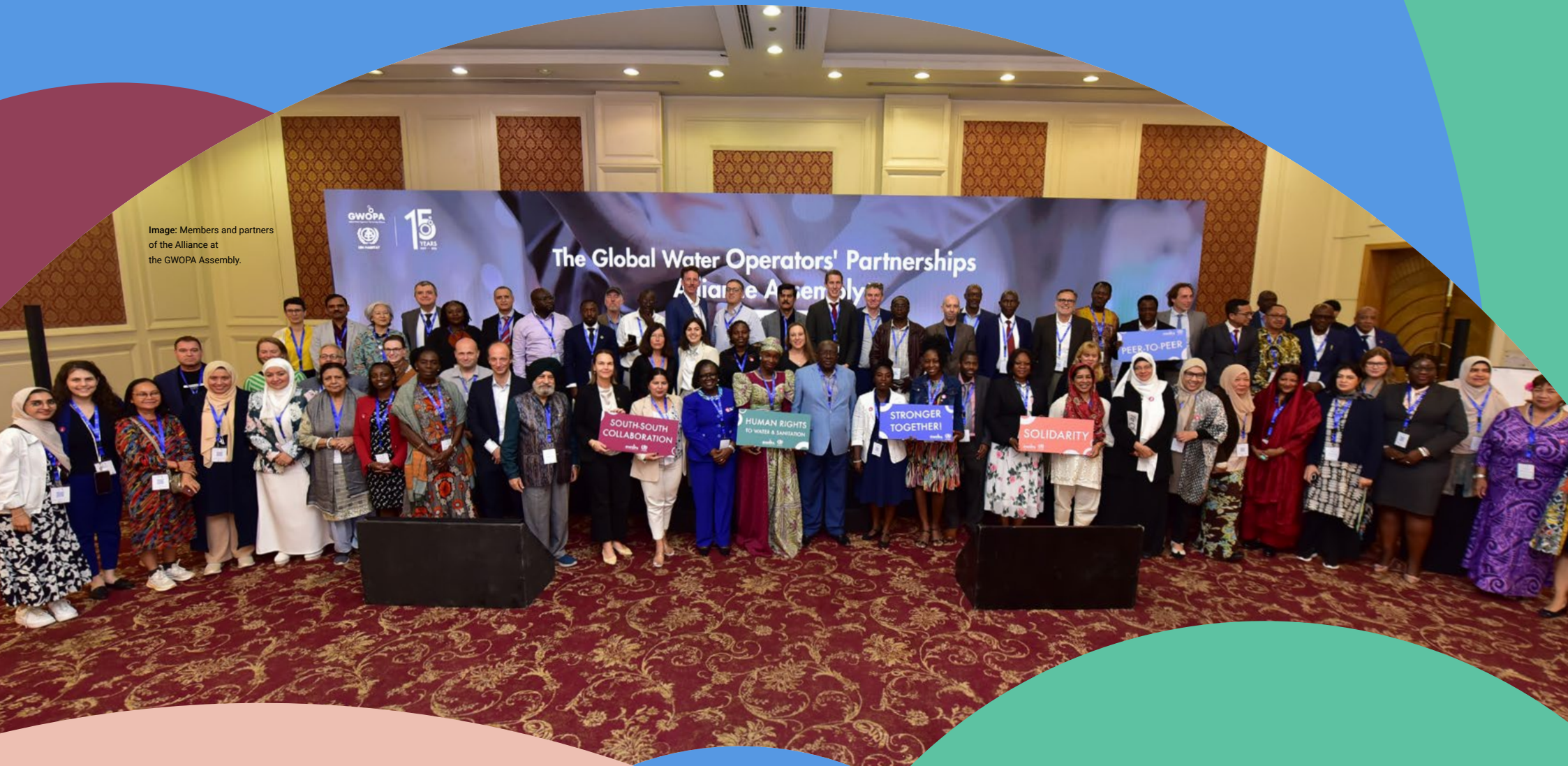
Image: Members and partners of the Alliance at the GWOPA Assembly.