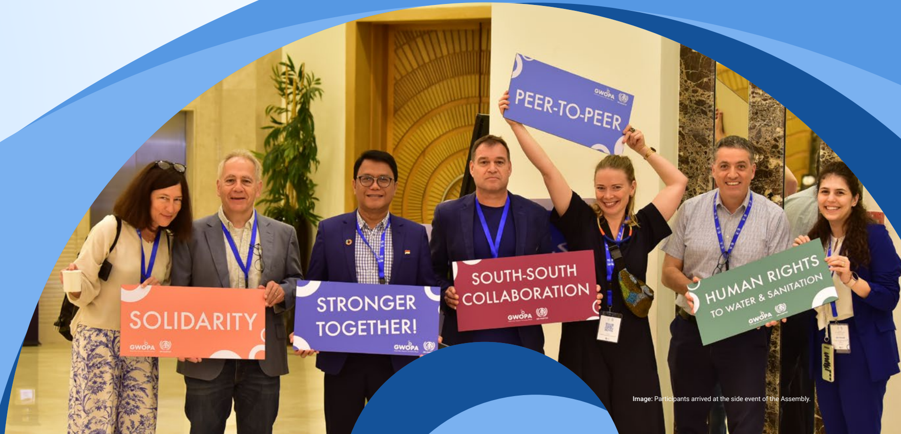
Image: Participants arrived at the side event of the Assembly.

Operationalizing Sanitation-focused WOPs (SWOPs)