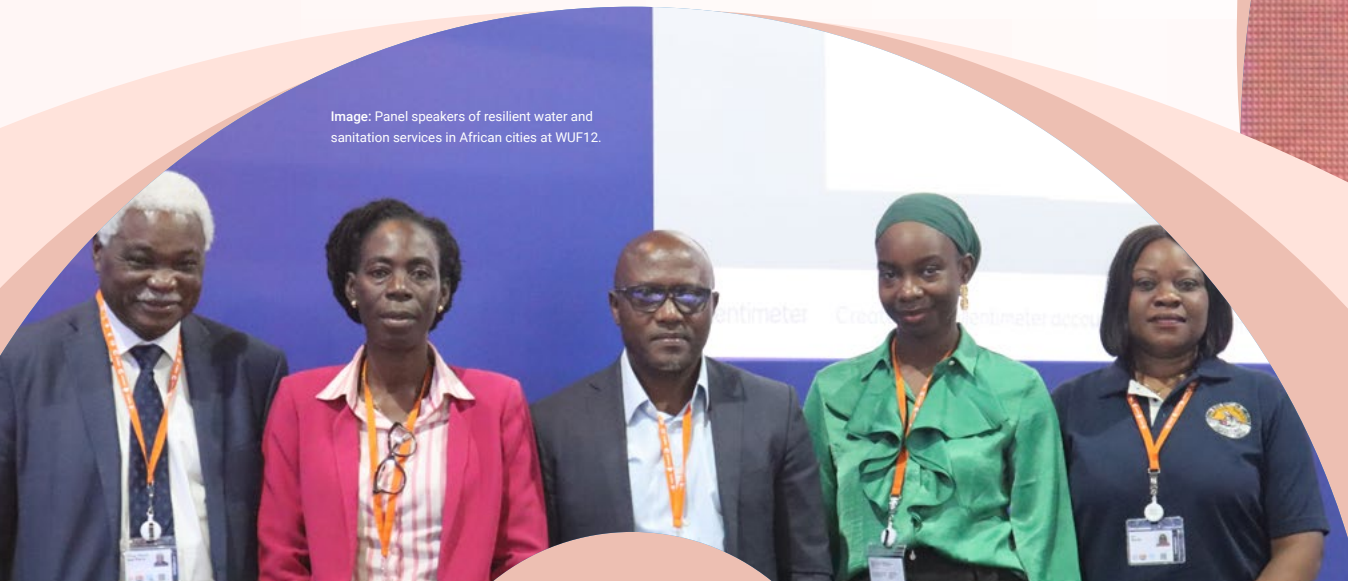
Image: Panel speakers of resilient water and sanitation services in African cities at WUF12.