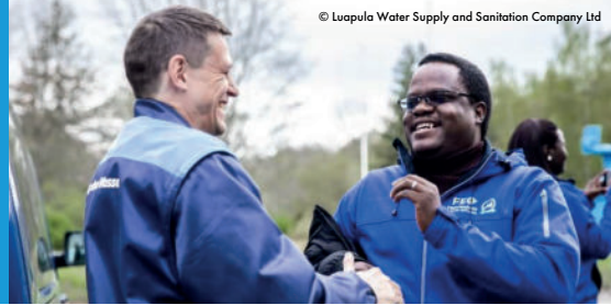
© Luopula Water Supply and Sanitation Company Ltd